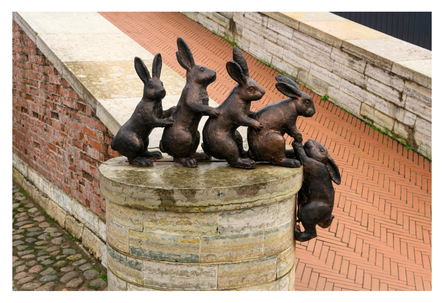
St. Petersburg is home to several unique and beloved animal sculptures, each imbued with cultural symbolism and local folklore. Among these are the Mice Monument and the Hare Escaping Flooding Monument, both of which add charm and historical depth to the city's urban landscape.

The Mice Monument captures the industrious and resilient spirit of St. Petersburg's inhabitants. This intricately crafted sculpture depicts two mice in a playful yet meaningful interaction, symbolizing perseverance and community spirit. Steeped in local legends, the monument reflects the hardworking nature of the city's people, who have contributed to its growth over the centuries. Visitors often interact with this whimsical artwork, touching the mice for good luck or posing for photographs, making it a popular attraction.