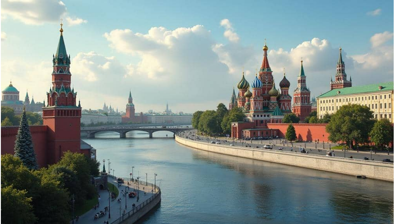
Artistic Rendering of Moscow

Moscow's culture and history, often deeply intertwined, form a rich tapestry that underpins the city's identity. As the heart of Russian civilization, Moscow boasts an architectural landscape that reflects its storied past and dynamic evolution. Iconic structures such as the Kremlin and Saint Basil's Cathedral are not merely historical landmarks but symbols of Russian resilience and ingenuity.